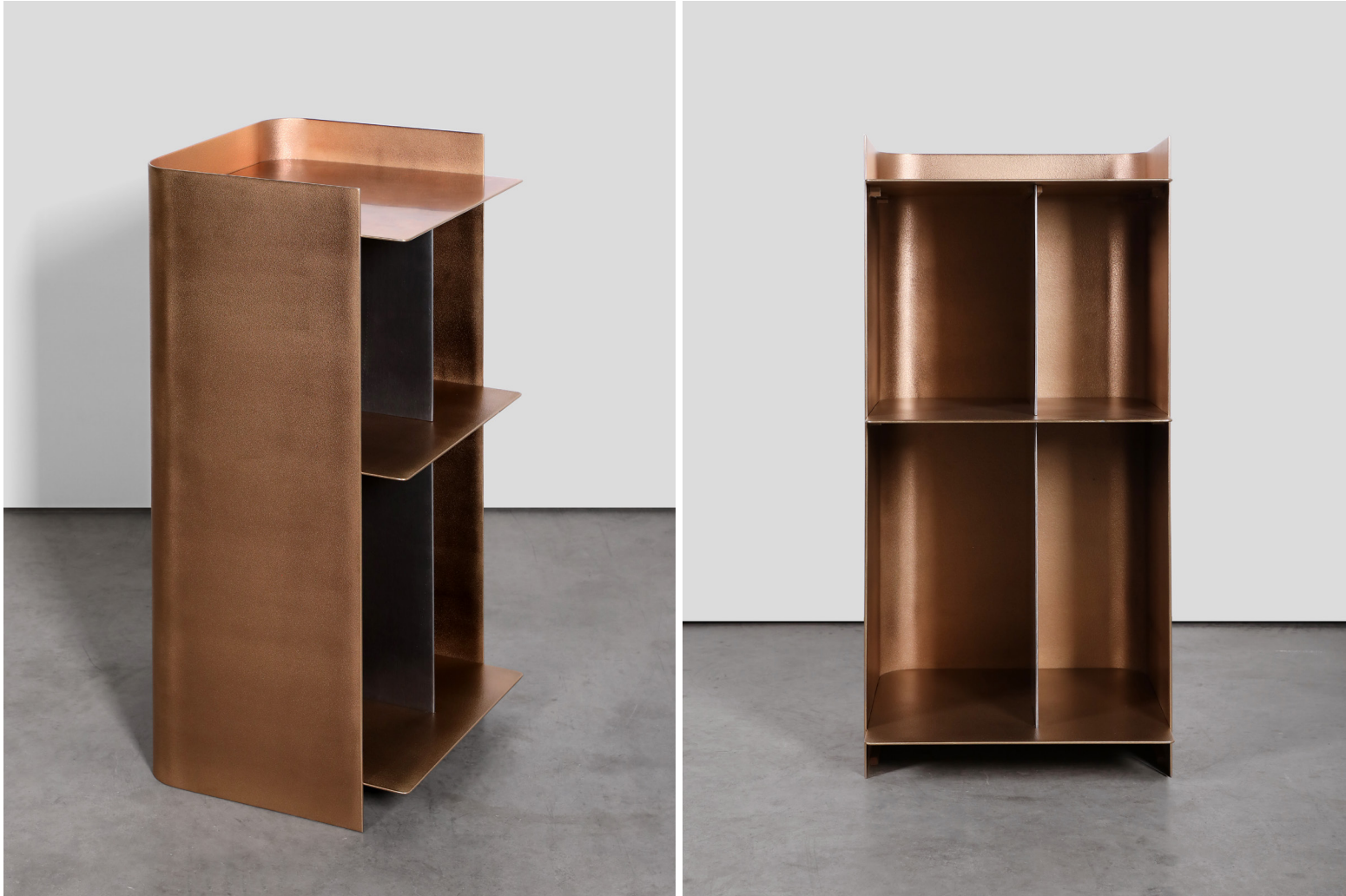
Drinks Cabinet 83